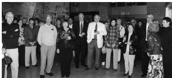
The opening of the Scarlet Settlement was well attended. Support for the exhibition was provided by the PEI Division and Calgary Division of the RCMP Veterans' Association and by the Friends of the Mounted Police Heritage Centre .