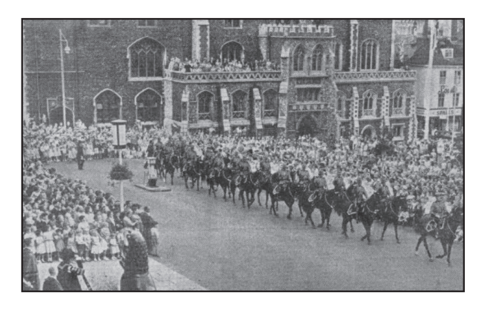
Thousands of people lined the streets to welcome the Ride to Norwich, July 1, 1957.

Peterborough was our next stop and the rain and mud were unmerciful. When the rain started we couldn't rehearse. The next day it rained and the grounds were so muddy that they had to use tractors to bring horse