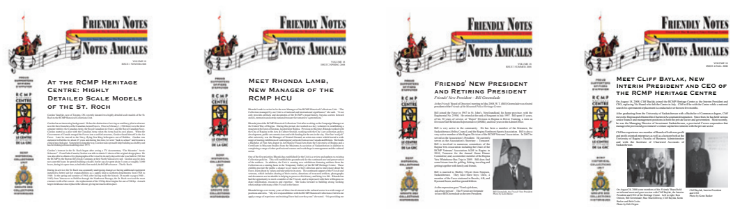
Winter 2008, Spring 2008, Summer 2008 and Fall 2008 issues of the Friendly Notes

More and more members are taking advantage of receiving the Friendly Notes electronically. The benefits of this include: convenient and timely access to the Friendly Notes – you receive the Friendly Notes a week to ten days earlier; environmentally friendly; and, reduces costs of printing and mailing.