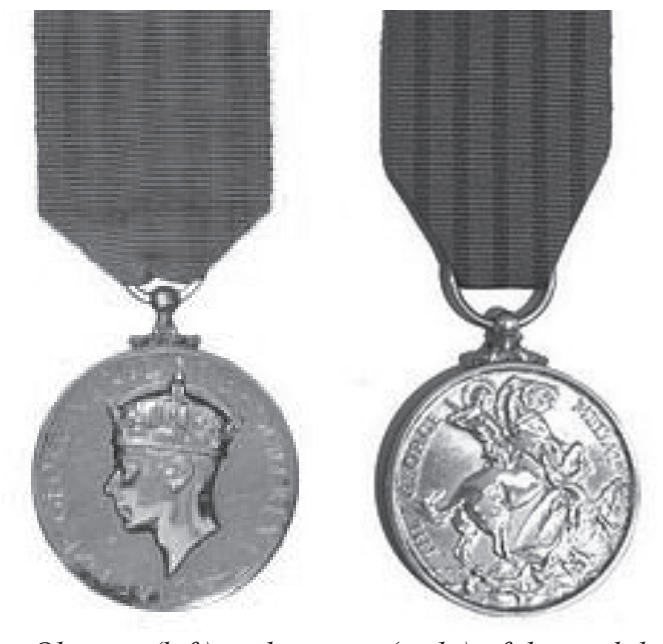
Obverse (left) and reverse (right) of the medal.