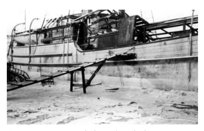
A protective covering was built over St Roch when overwintering. Here shown at Tree River in 1930's (Larsen fonds VMM). 7

On seeing the St Roch as she is today, preserved in the Vancouver Maritime Museum safe on dry land, one can hardly imagine the experience of the crew aboard the ship when they voyaged in ice-ridden,