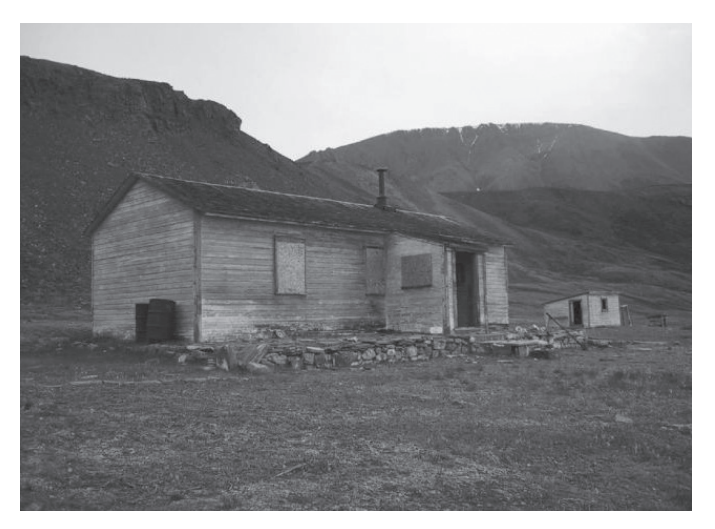
Deserted RCMP building, Dundas Harbour (D.Riedel, 2007) 12

For hours they cruised back and forth under the lea of a mile long, flat ice-berg for shelter until the gale subsided. Late after-noon of August 18 they anchored in front of the deserted, very exposed police detachment, located at a small, ice free bight to the east of Dundas Harbour. Here they posted the first cylinder; prior to the journey, preparations were made for Larsen and his crew to build a series of cairns and to deposit brass cylinders containing